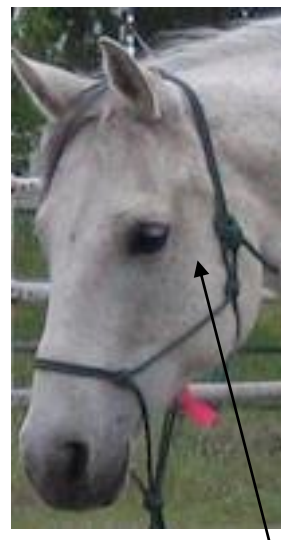
Location of last molar

All those teeth! Each kind of tooth is designed to perform a specialized function. Next time we'll look at how horses eat.